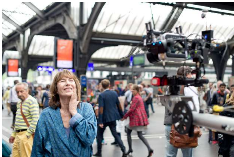
'La femme et le TGV'