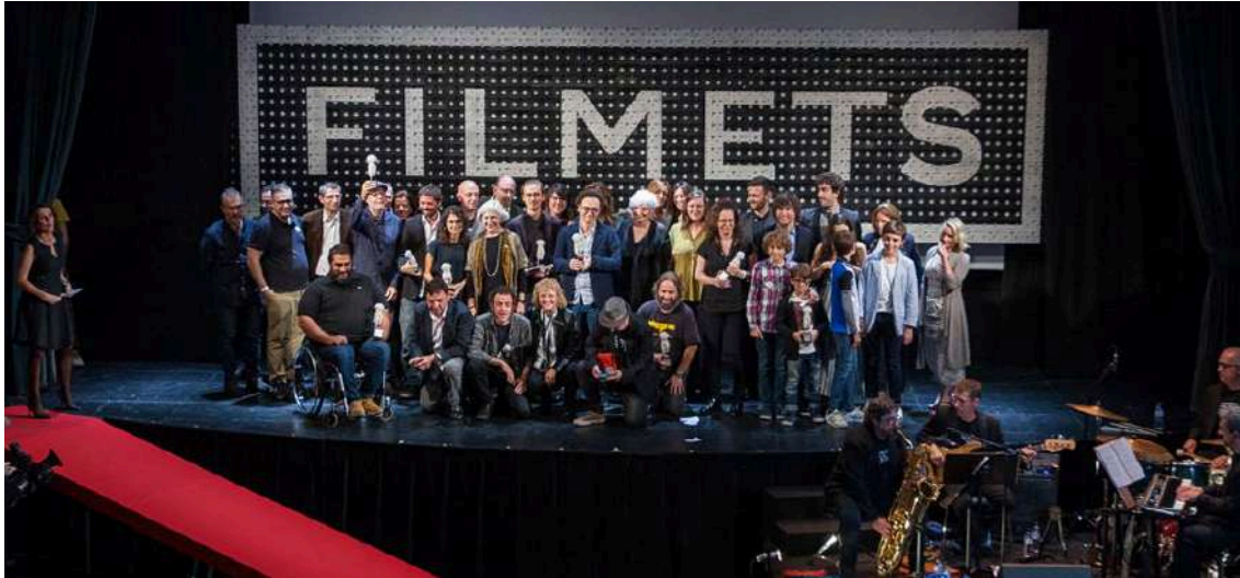
Family Picture, Filmets 2016