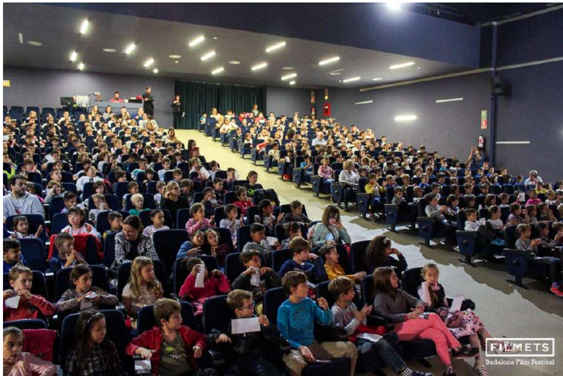
Filmets sessions at Teatre Blas Infante

Thus, the most appropriate short films for children will be shown in the public libraries of Badalona: Can Casacuberta, Lloreda, Pomar, Sant Roc, Llefià-Xavier Soto, Canyadó and Casagemes-Joan Argenté.